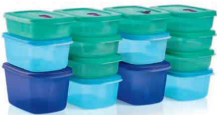
CrystalWave® PLUS 14-Pc. Set Ultimate Planover Set pg. 5 of the Fall & Holiday catalog

Look for Host exclusives available in this brochure and the Fall & Holiday catalog!